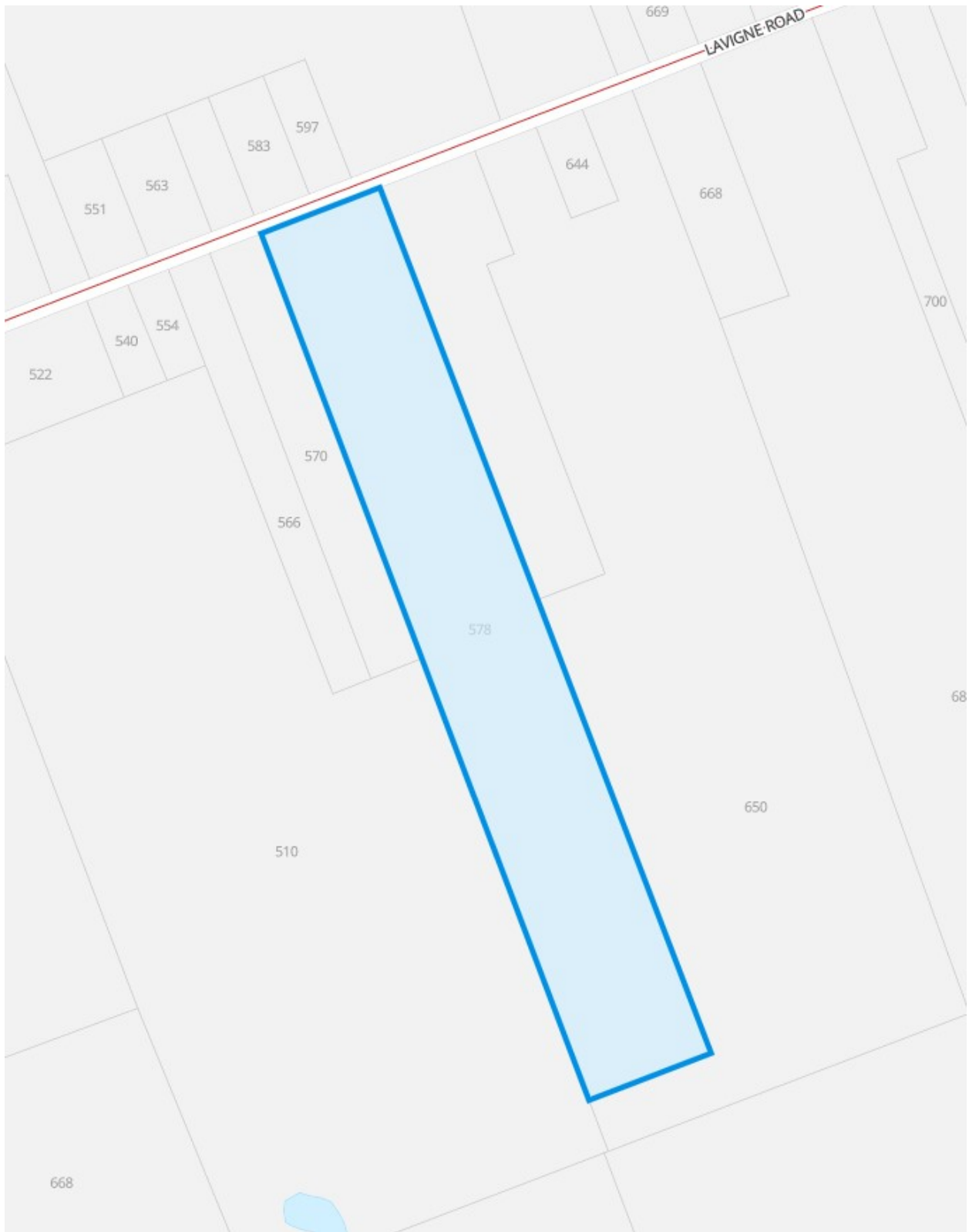
Figure 1: Property Location